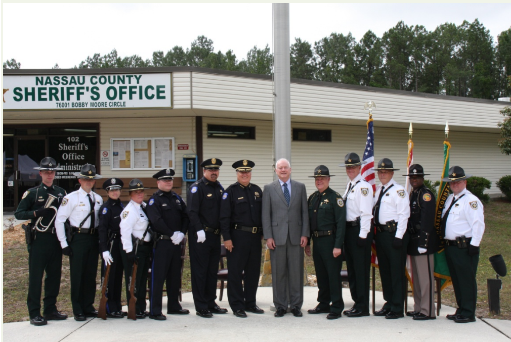
Law Enforcement Memorial